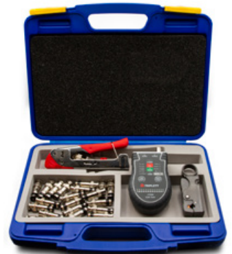
CS-TK00 Universal Compression Tool Kit