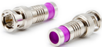
302-8241CSTP BNC Male Compression Seal