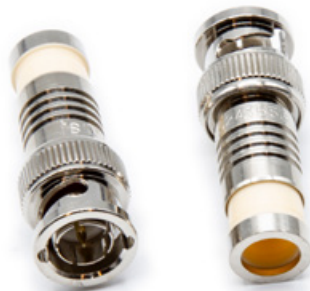
302-10CSTP BNC Male Compression Seal