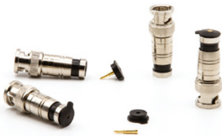
302-00CSTP Universal BNC Male Compression Seal