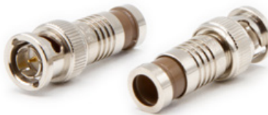
302-N2CSTP BNC Male Compression Seal