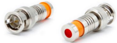
302-8240CSTP BNC Male Compression Seal