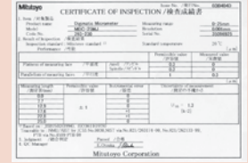
Certificate of inspection