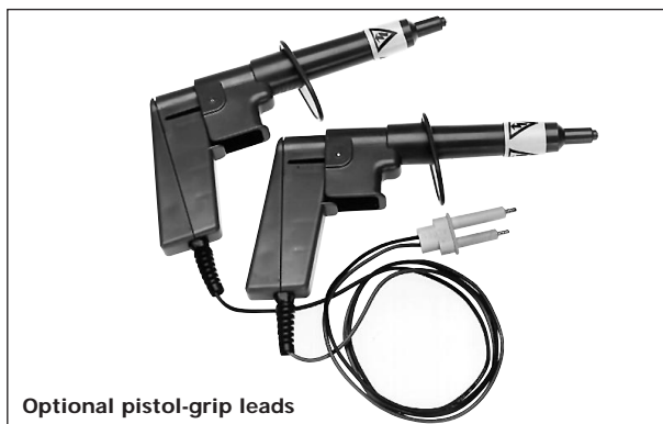
Optional pistol-grip leads