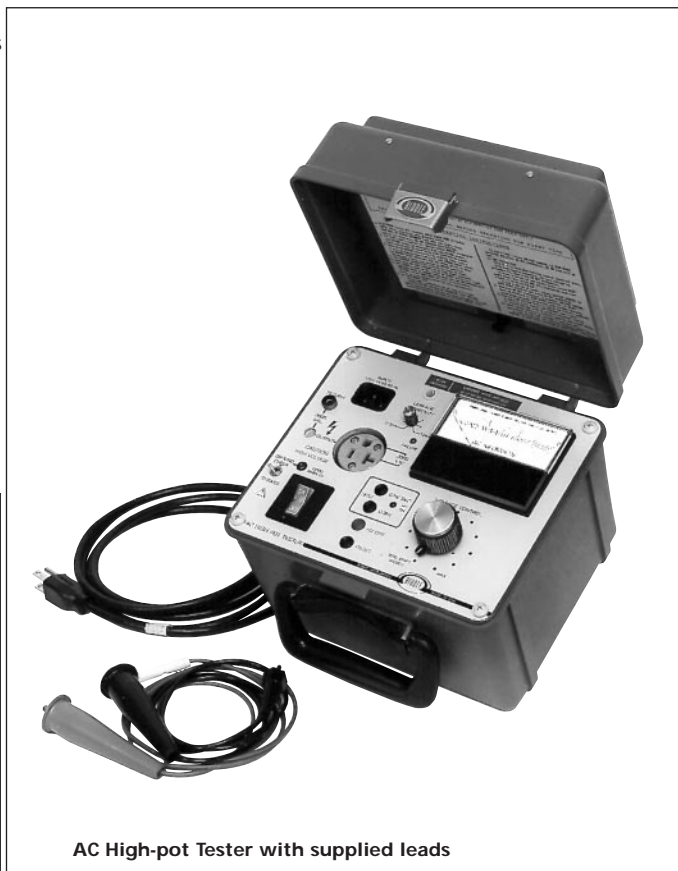
AC High-pot Tester with supplied leads