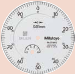
2044S 2044S-60 2044S-09