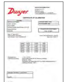
6-Point Calibration Certificate Included

The SERIES 2000-HA High Accuracy Magnehelic® Gage is twice as accurate as the standard Magnehelic® gage. The well-engineered High Accuracy Magnehelic® Gage offers a mirrored overlay as standard in order to eliminate any parallax error when taking measurements. A six point calibration certificate is included with each high accuracy model. The rugged IP67 casing helps fully protect against dust and water ingress. The redesigned corrosion resistant brushed 304 stainless steel bezel option offers a clean tapered design, yet minimizes the possibility of any dust accumulation on the edges.