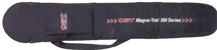
Soft Padded Cordura® Carrying Case

19-552 Soft Padded Case for Magna-Trak Locators, yellow 19-553 Hard Case for Magna-Trak Locators 19-559 Soft Padded Case for MT-102, chartreuse