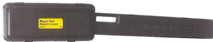
Hard Carrying Case