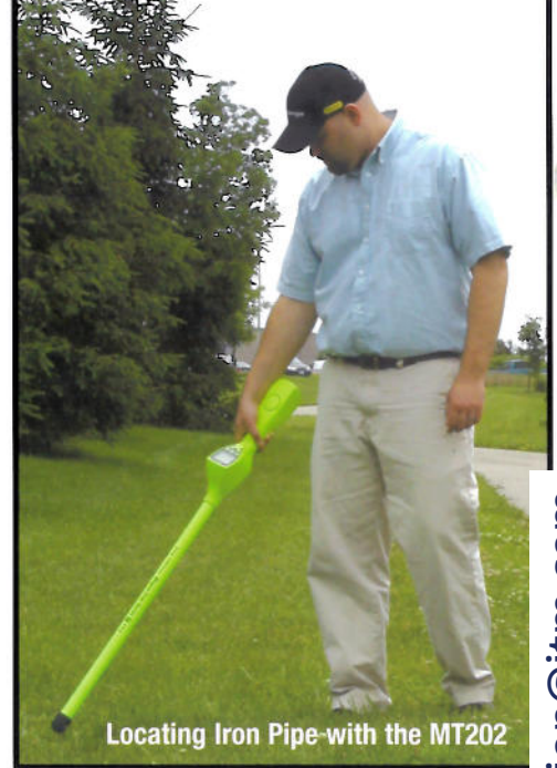
Locating Iron Pipe with the MT202

Locate ferrous objects under ground, under water, or in snow: