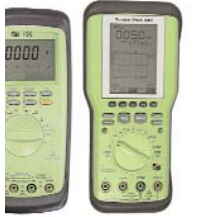
~ 196 440