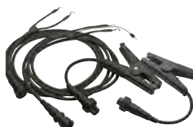
+ KC1 Kelvin clip 3 m leads