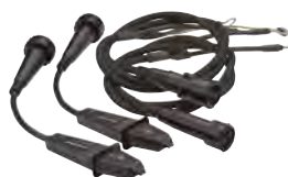
+ DH4-C probe 1.5 m leads