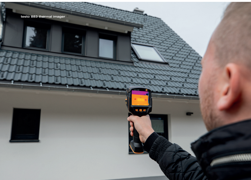
testo 883 thermal imager