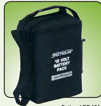
Optional BP-12A battery pack

Note: A compact, lightweight battery pack (model BP-12A) is available as an accessory for the CH-50P/12. It comes with a 12V, 7 amp/hr sealed lead acid rechargeable battery, a charger and a nylon case with belt loop and shoulder strap. Permits field use of the lamp in areas where there are no AC outlets.